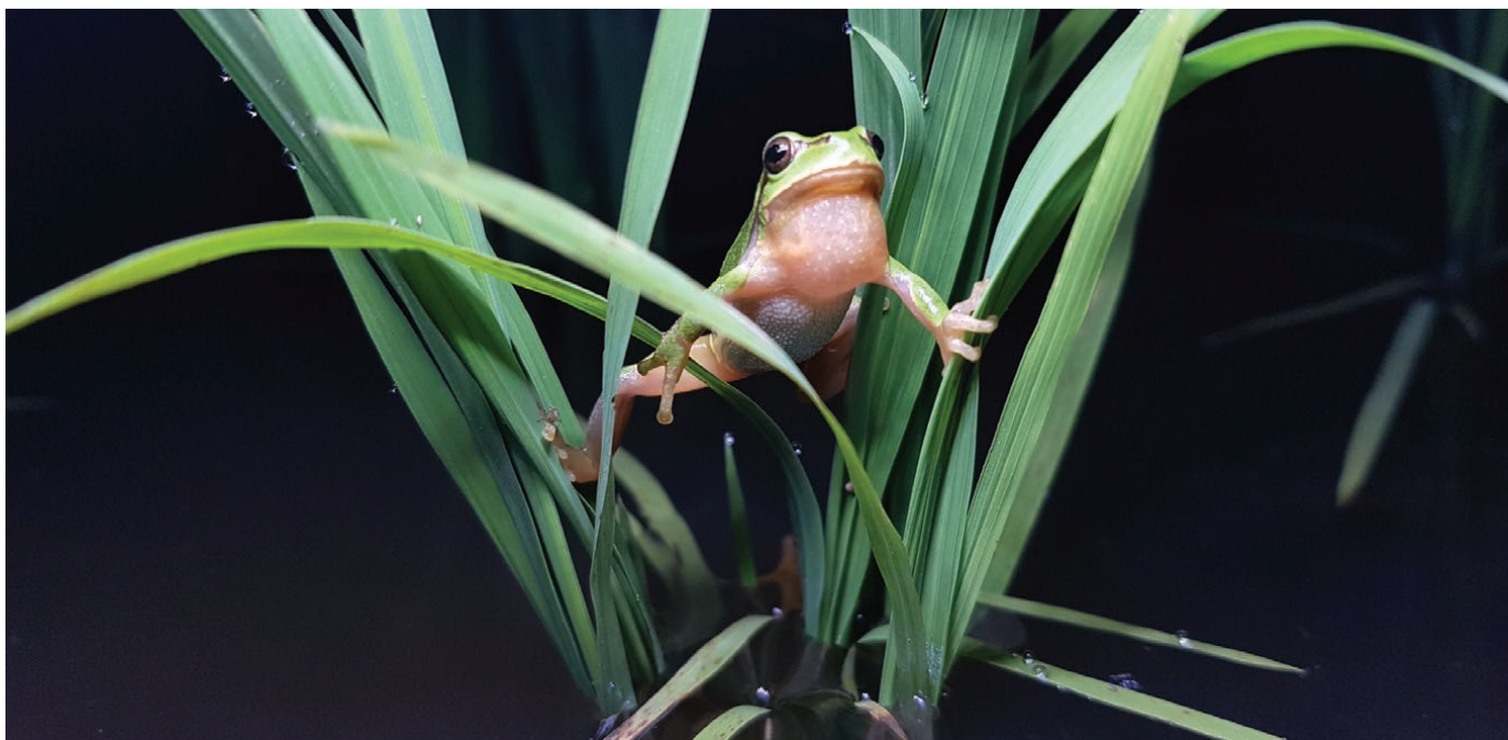
Dryophytes suweonensis