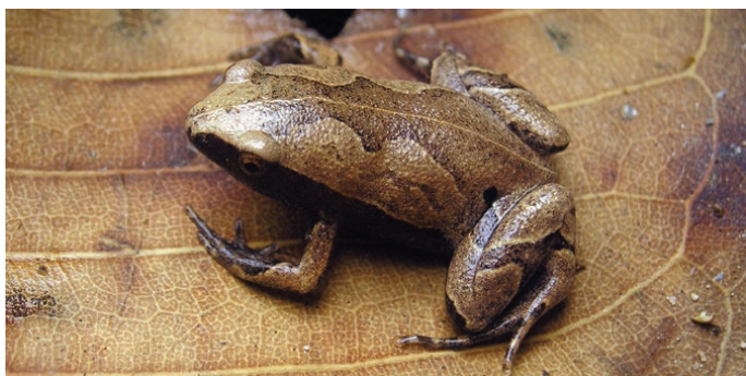
Hamptophryne boliviana

Number of instances where advice and information are sought and given: 1