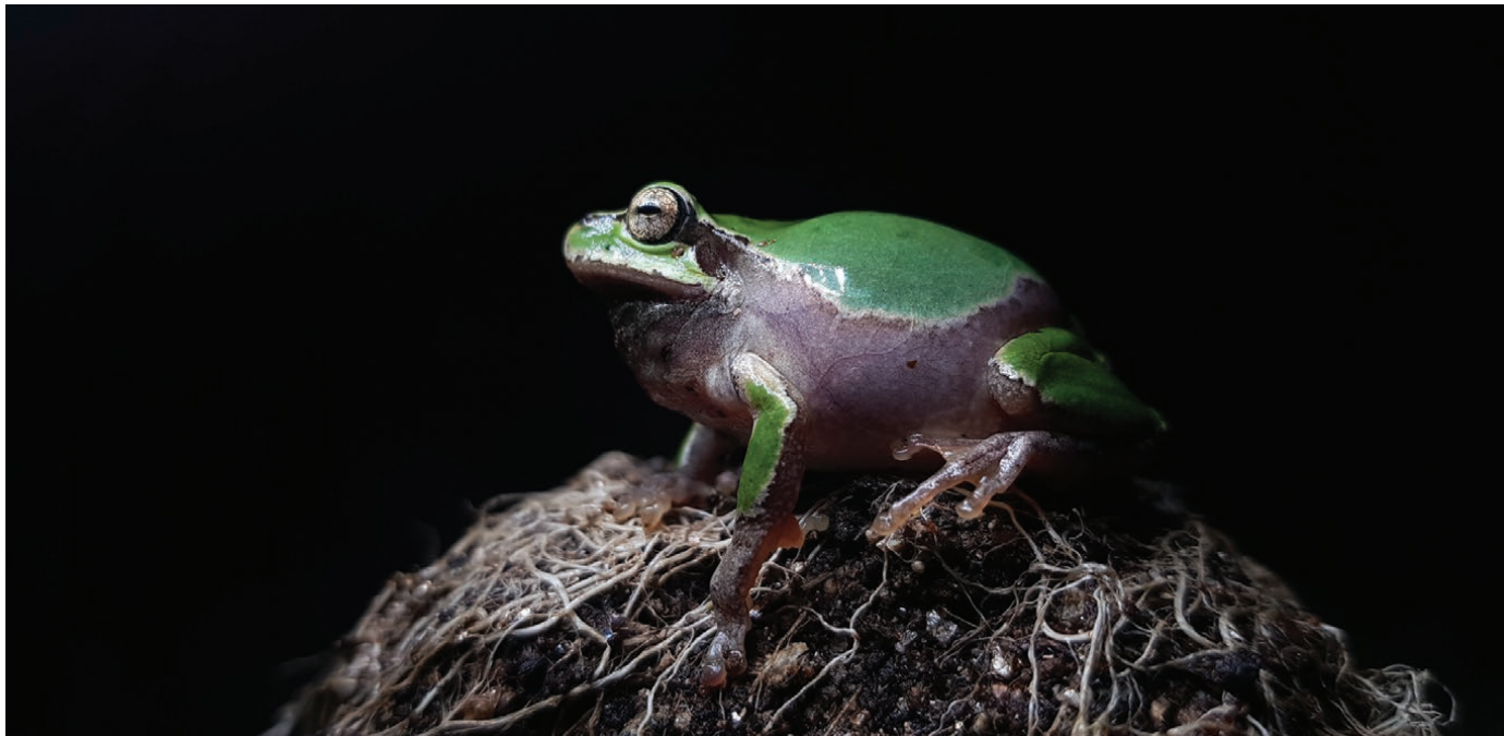
Dryophytes japonicus

Result description: We have retained our partnership with our current donor for 2023. We are exploring other options using the Amphibian Conservation Action Plan (ACAP) as a roadmap.