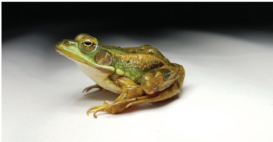
Pelophylax chosenicus