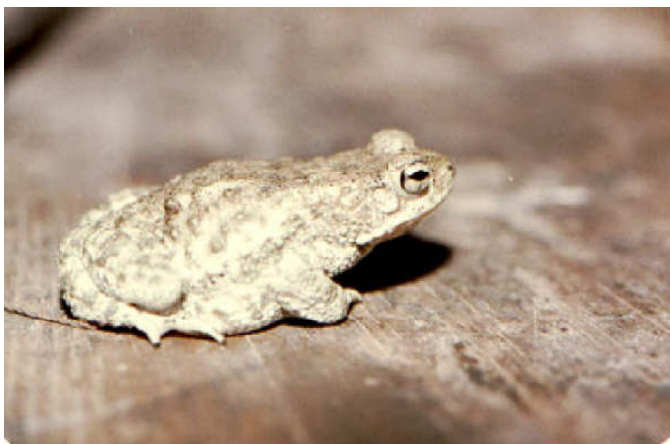
Bufo stomaticus

color, with characteristic bulging round body, and a weak tail. They form loose schools along marginal waters, possess two rows of denticles, with biting jaws, and are rasper feeders.