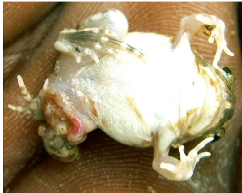
Lankanectes corrugatus (Corrugated water frog) with ectromella

Sri Lanka is an island of 65,610 km 2 in area. The amphibian diversity and species richness per unit area of land is one of the highest in the world. Presently, a total of 106 amphibian species are known from Sri Lanka. However, of these, 21 species are considered extinct. Recent observations indicate that amphibians of the country are facing many threats. Additionally, many malformations and parasitic infections were observed in frogs. Sri Lanka is an agricultural country, and presently agrochemicals are widely used in agriculture and plantations and the runoff water from these lands and industrial waste accumulate in waters inhabited by some frogs as well as pollute the natural habitats of frogs. Several cases of parasitic infections and leech attacks of amphibians were also observed.