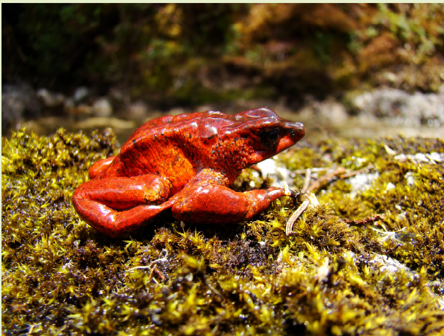
Atelopus carrikeri