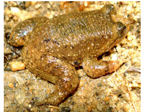
Sphaerotheca species with a severe wound.