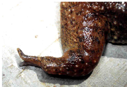
Lankanectes corrugatus (Corrugated water frog) with ectromella

The major threats posed to amphibians of the country are habitat loss, alterations and degradation. In addition, preliminary observation made on Polypedates eques , an endemic frog inhabiting the highest plain of the country (Horton Plains National Park, 2000-2300 m) showed the presence of a life threatening Proteocephalan Cestode infection in 19 (31%) males of the 61 studied. Recently (2006) frogs were observed with ectromella, a malformation condition as reported by Meteyer (2000) in addition to frogs with large wounds (similar to carcinoma).