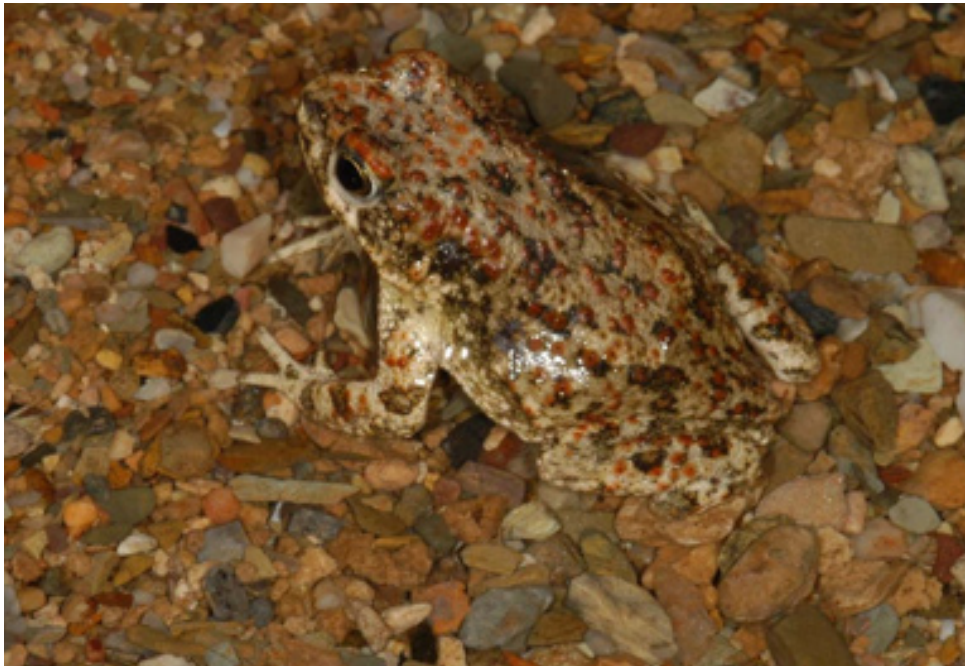
Figure 3. Dorsal color pattern of the Naukluft toad

occupy an extremely small area (IUCN 2000).