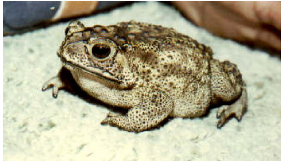
Bufo melanostictus © Muhammad Sharif Khan

Bufo stomaticus , excluding higher mountain ranges, is the most common toad throughout Pakistan. Other species of toad: latastii , baturae , pseudoraddei , siacheninsis , himalayanus and hazarensis are Hi-