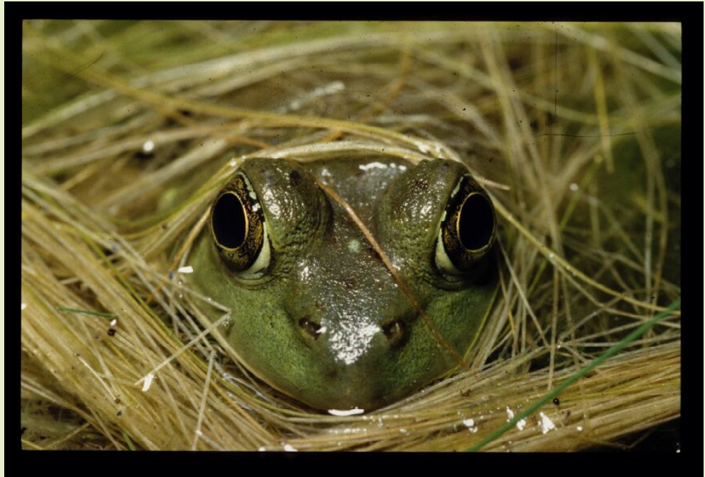
Rana catesbeiana

The closing date for nominations is June 1 2008. Nominations should include the name of the