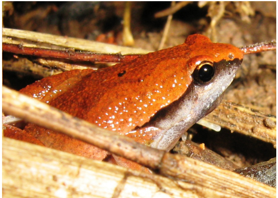
Microhyla heymonsi

Diurnal surveys of the mangroves recorded Fejervarya cancrivora (Dicroglossidae). At Kep, this species appears to be confined to mangrove habitat. F. cancrivora has never before been reported in a survey of eastern Cambodia.