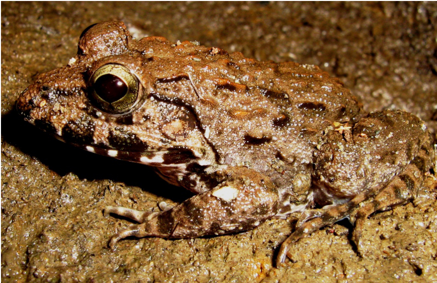
Fejervarya cancrivora

Amphibian abundance and calling activity were low. Two species were encountered, Polypedates leucomystax (Rhacophoridae) and Limnonectes kohchangae (Dicroglossidae). This latter species has a restricted range in Cambodia and Thailand, which is thought to be centred on the Cardamom Mountains (Stuart & Emmett, 2006).