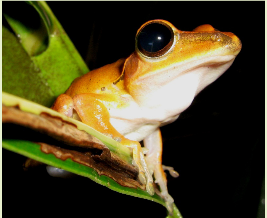
Polypedates leucomystax

discoveries in eastern Cambodia, cataloguing the species diversity in previously unstudied or understudied regions will be critical to effective conservation efforts. It is therefore important to assess their suitability as habitat for different taxa in order to set conservation priorities.