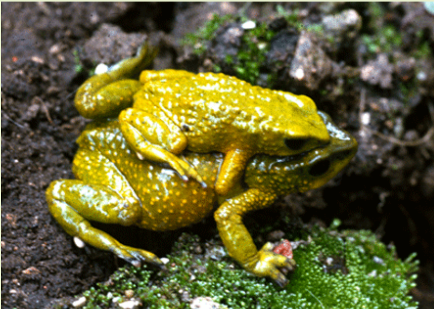
Atelopus exiguus

As we scour the crystal clear water for signs of life, a persistent wind drives the thin damp air through my thin layers of clothing. In a patch of forest high in the Andes of southern Ecuador, we are on a mission to find the Critically Endangered Atelopus exiguus . These small frogs used to be so abundant that a ranger who walks the trails every day would watch his step to avoid them; he hasn't seen one in 12 years. It is hard to feel optimistic that we will find any.