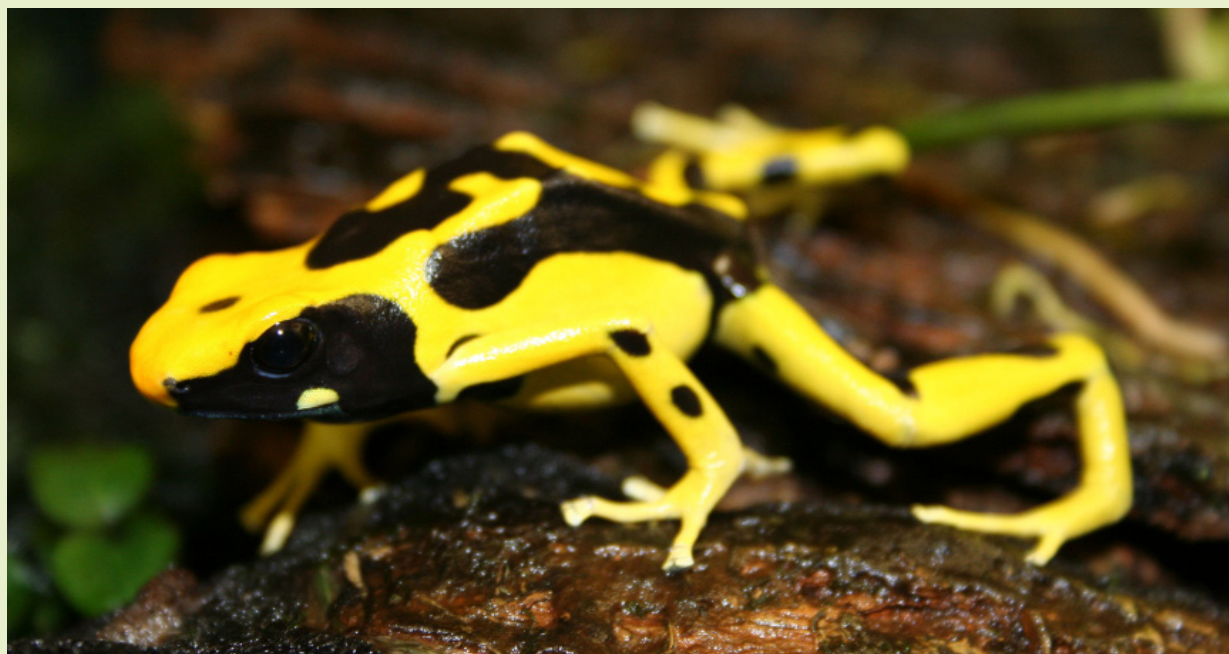
Dendrobates tinctorius