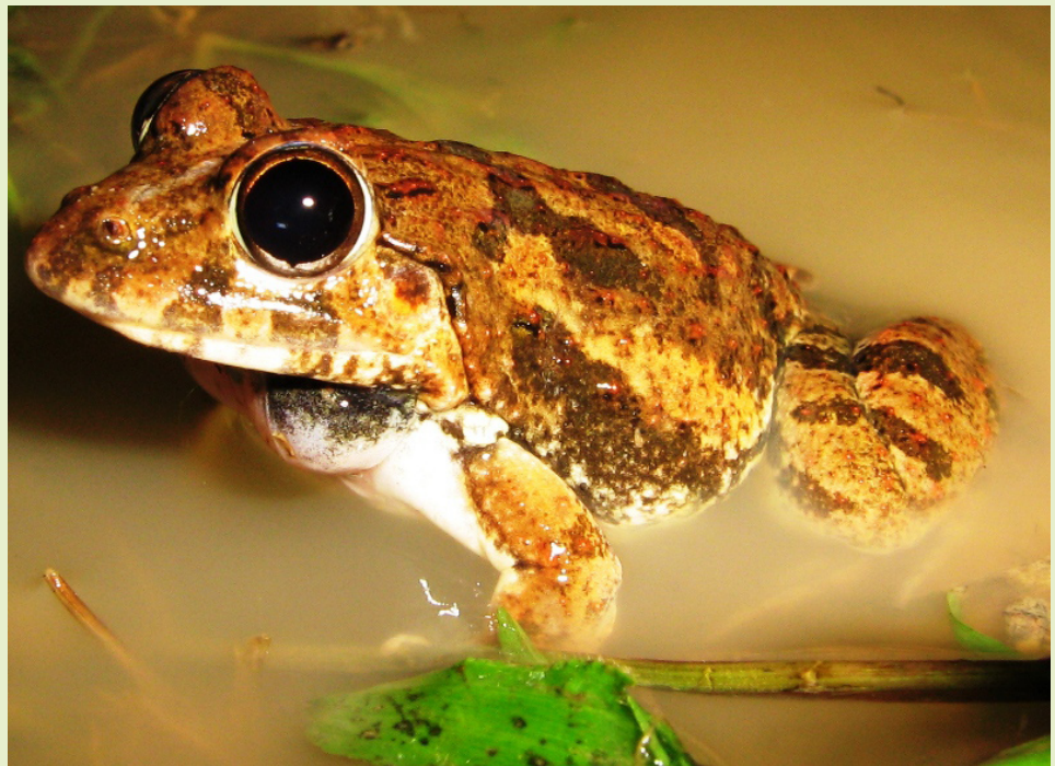
Fejervarya limnocharis

For further information please contact: philip.bowles@jcu.edu.au