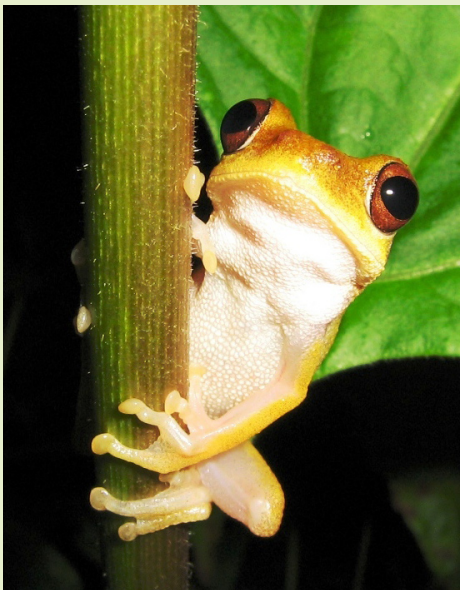
Chirixalus nongkhorensis