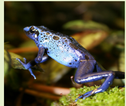
Dendrobates azureus